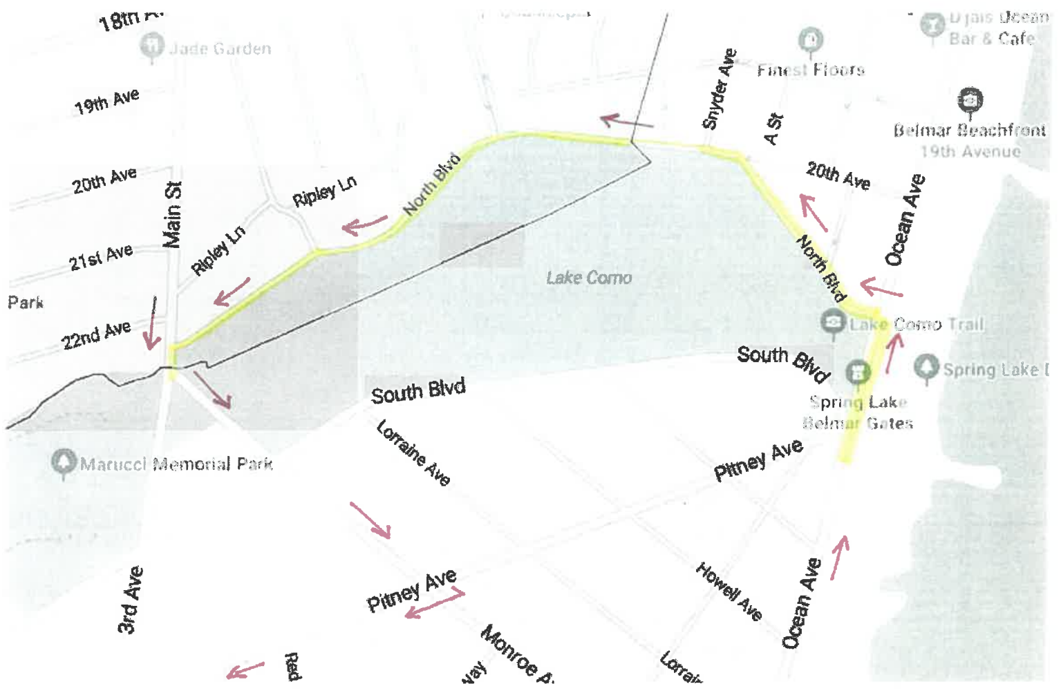
PORTION OF RACE IN LAKE COMO